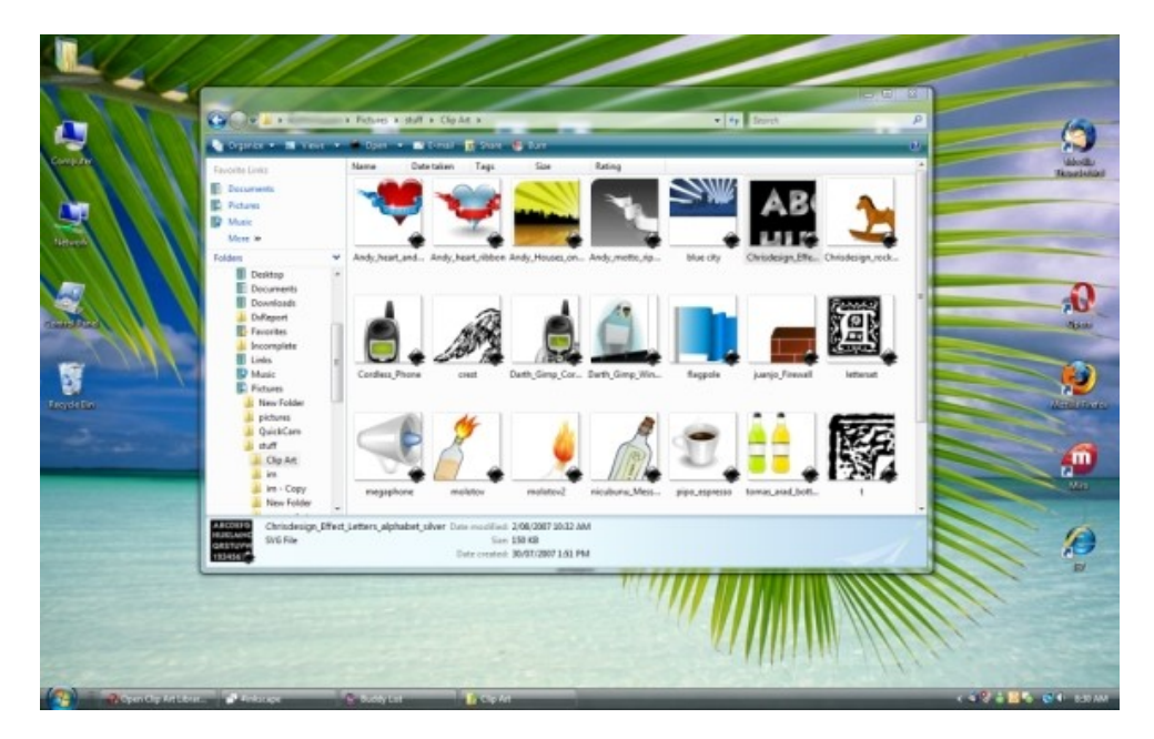
Windows Vista Screenshot

Vista includes technologies which employ fast flash memory to improve system performance by chaching commonly used programs and data. Other new technology utilizes machine learning techniques to analyze usage patterns to allow Windows Vista to make intelligent decisions about what content should be present in system meomry at any given time. As a part of the redesign of the networking architecture, IPv6 has been fully incorporated into the OS and a number of performance improvements have been introduced, such as TCP window scaling. For graphics, it has a new Windows Display Driver Model and a major revision to Direct3D. At the core of the OS, many improvements have been made to the memory manager, process scheduler and I/O scheduler.