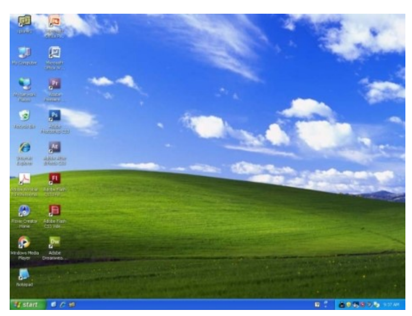
Windows XP Screenshot

Windows XP features a task-based GUI. XP analyzes the performance impact of visual effects and uses this to determine whether to enable them, so as to prevent the new functionality from consuming excessive additional processing overhead. The different themes are controlled by the user changing their preferences.